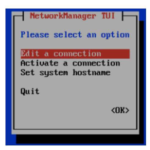
FIGURE 5 Network Manager TUI screen