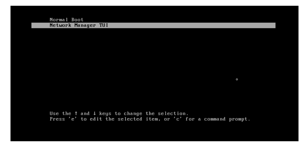
FIGURE 4 Console

Select Network Manager TUI to the set the static IP address, and Normal Boot to start SCI.